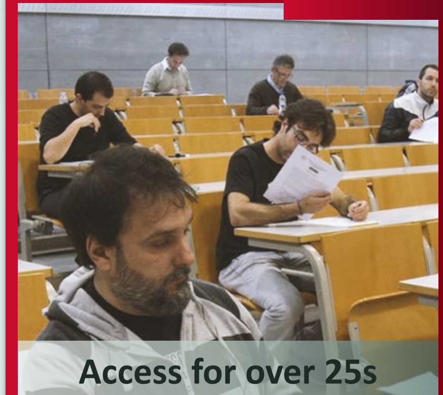
Access for over 25s

Over 25 years old with no academic requirements. You have to pass the specific access to university exam.