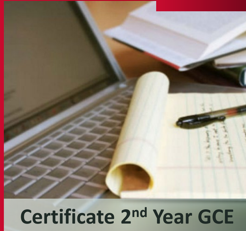
Certificate 2 nd Year GCE

If you do not yet have the GCE, certificate from your school that you are in the 2nd year of the GCE in the same year as the entry exam.