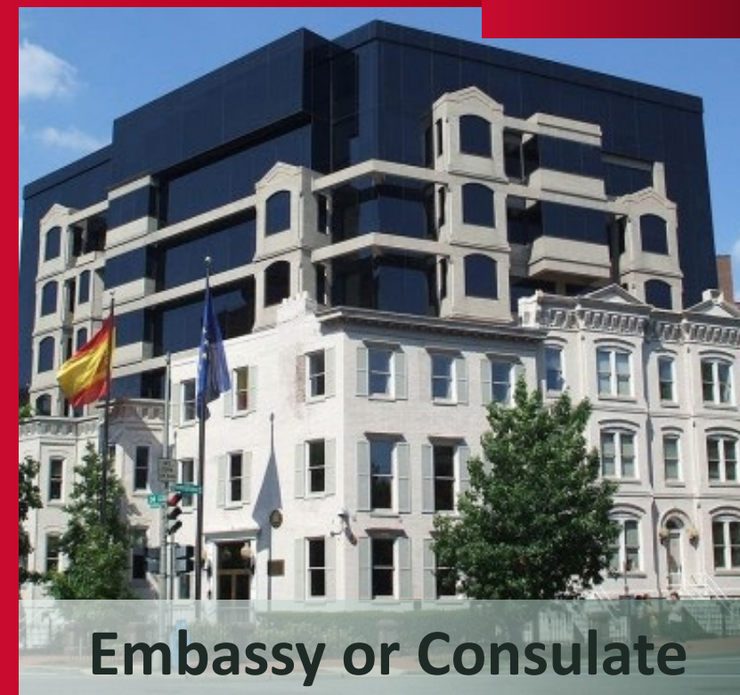
Embassy or Consulate

You should contact the ministry of education and science of the Spanish Embassy in your country or the Spanish Consulate closest to your city of residence.