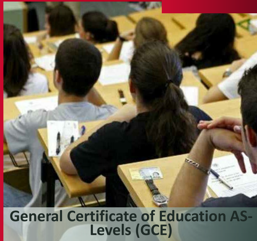
General Certificate of Education AS-Levels (GCE)

Hold the General Certificate of Education AS-Levels (GCE) or equivalent qualification.